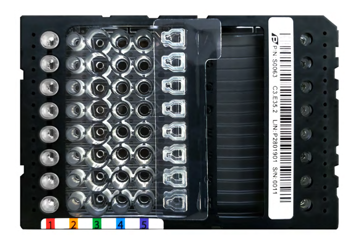
Ionic® Fluidic Chip